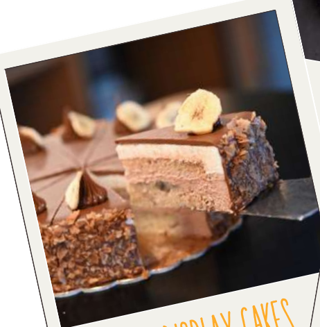
SWEET DISPLAY CAKES