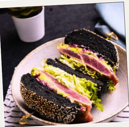
WASABI TUNA BURGER