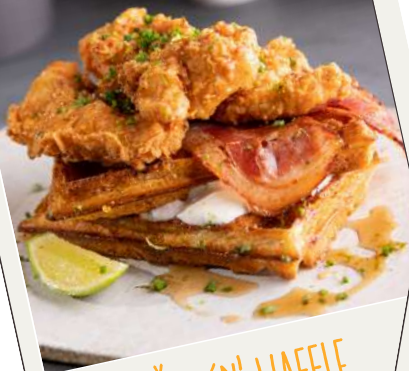
PIŠEK 'N' WAFFLE