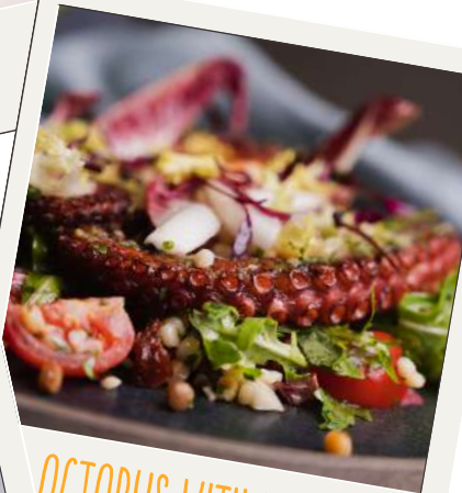
OCTOPUS WITH FREGOLA