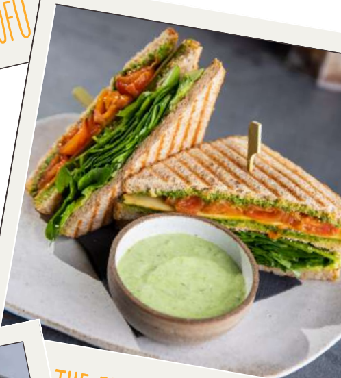
THE FRESH SANDWICH