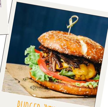
BURGER "THE ONE"